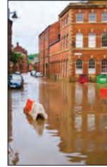
flood damage repairs

The strength of our business is our people, the feedback from our customers supports this -