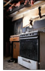
fire damage repairs